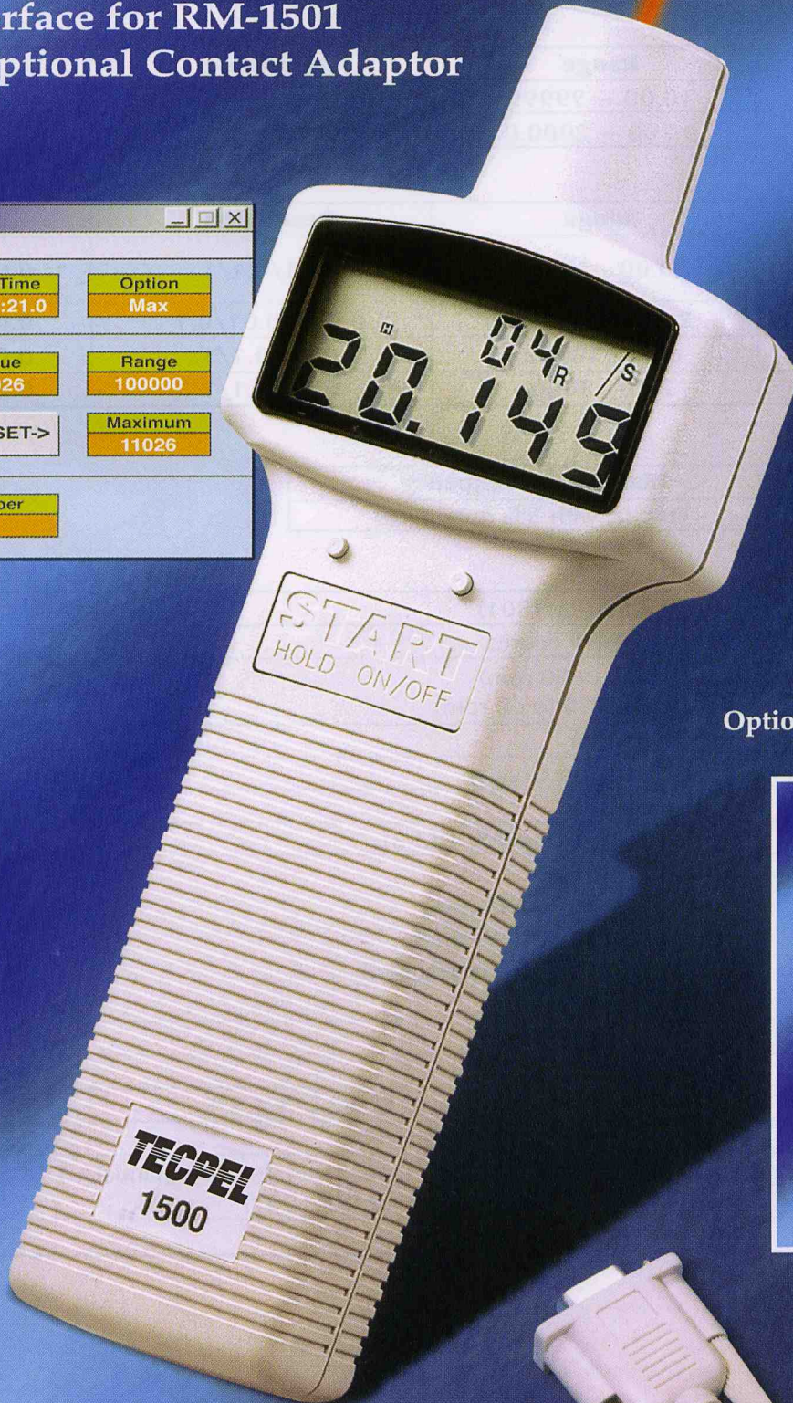
Optional Contact Adaptor RM 1502